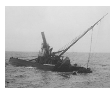
$14,000, was a total loss.

Built in 1884, the sailing steamer Celia set sail from Santa Cruz in a dense fog in August of 1906. She was bound for Monterey with a cargo of 160,000 board feet of lumber.